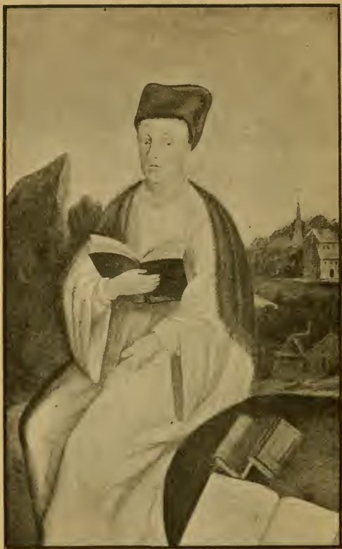
THOMAS À KEMPIS.

Photographed from the portrait at Geertruidenberg.)